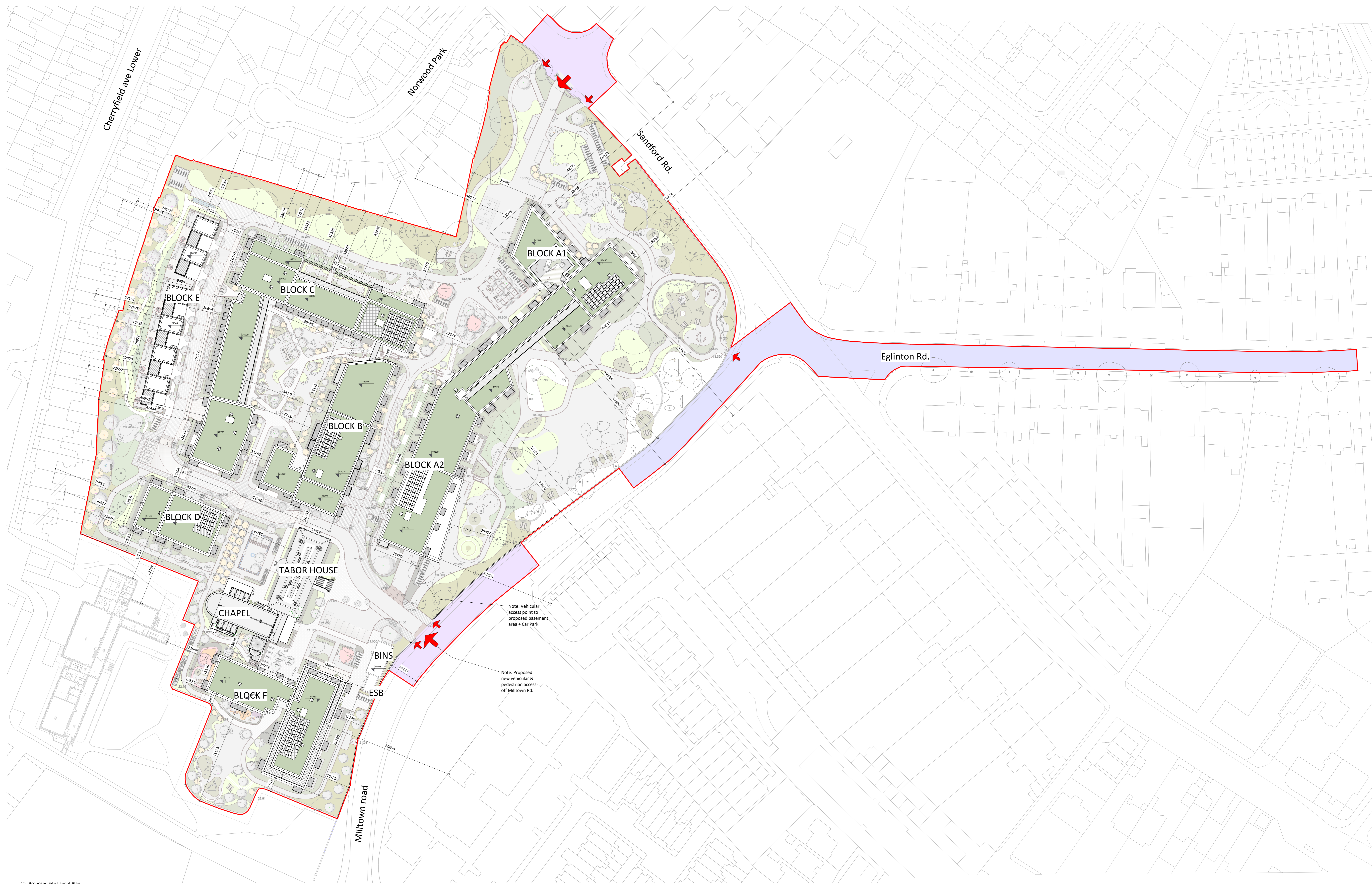
1 Proposed Site Layout Plan 1:500

Note: Vehicular access point to proposed basement area + Car Park