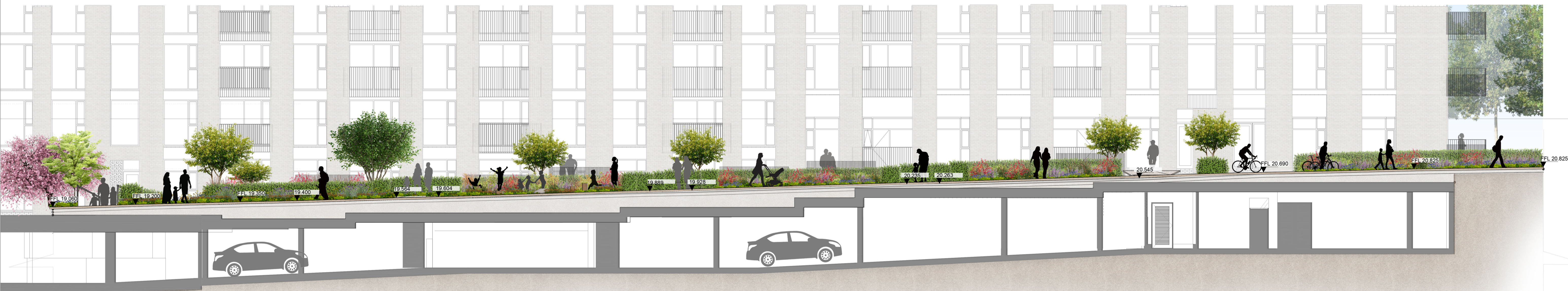
01 Block A2 Boulevard Section scale 1:100@A1

DISCLAIMER 1. This drawing is the property of Cameo & Partners Ltd. 2. It must not be copied or reproduced without written consent. 3. Do not scale from this drawing. 4. Check all dimensions on site before setting out.