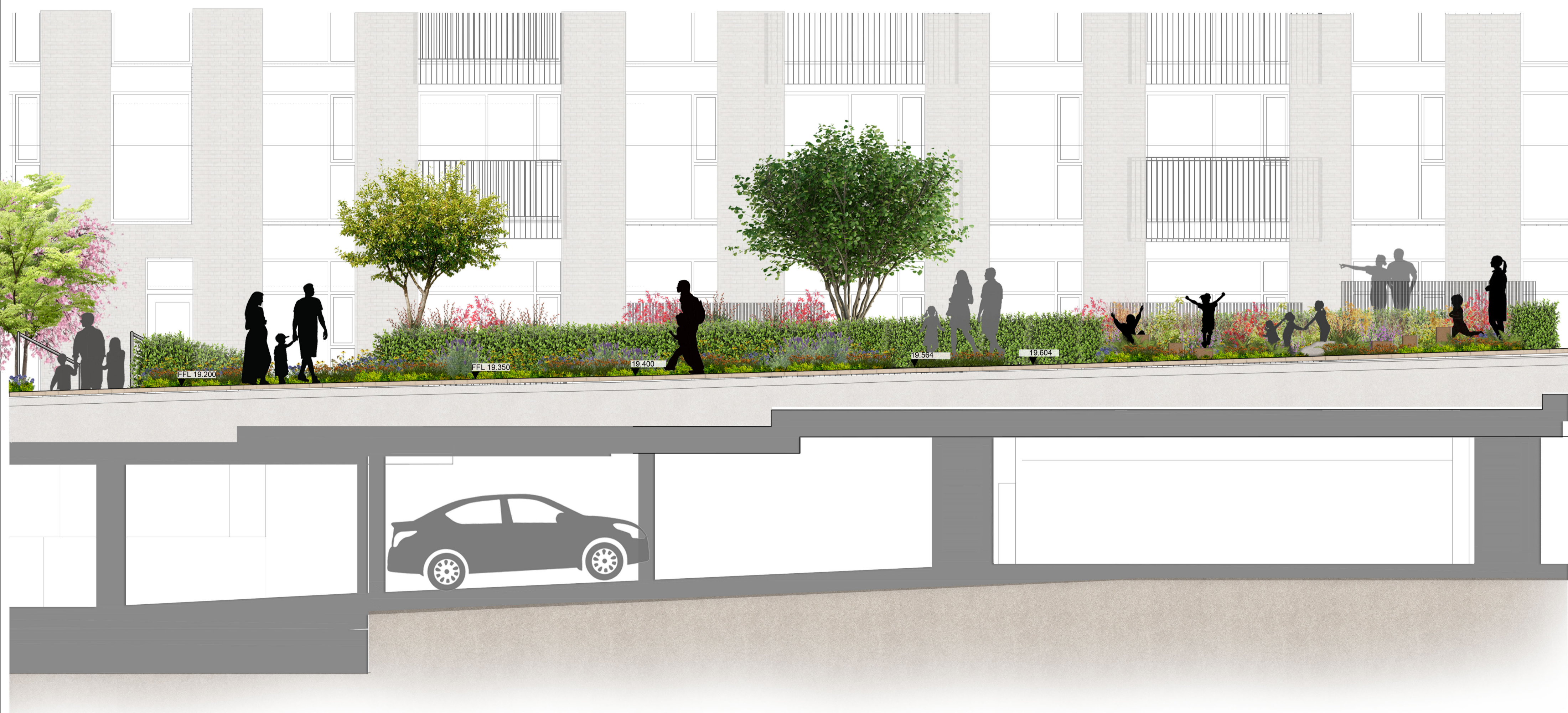
02 Block A2 Boulevard Section scale 1:50 @A1